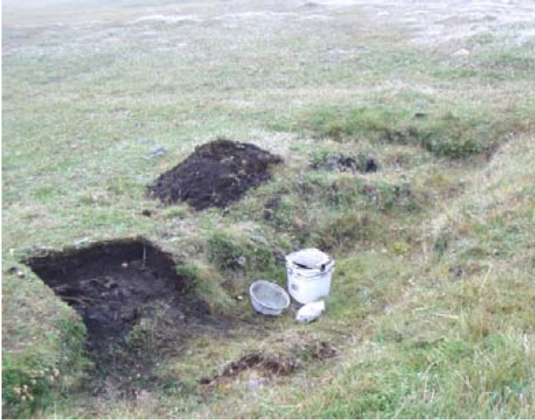
FIGURE 12: General view of the test pit and of the ancient Taylor's trench number 6, view toward northeast.