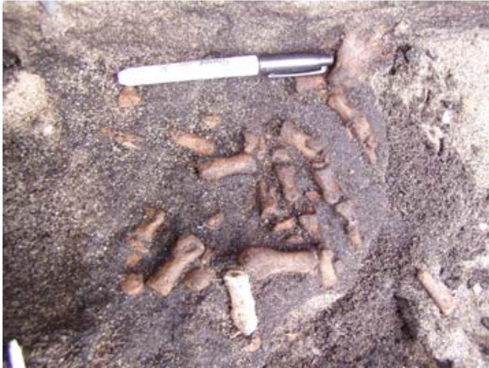
FIGURE 5: Seal flipper in situ