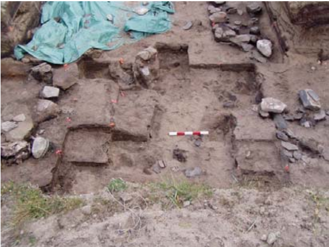
FFIGURE 10: Excavated part of level III, view toward south.

We started the excavation of level III with the main objective of finding characteristic material to document this occupation. We excavated around 6 square meters (Figure 10). We found bones and sparse lithic artifacts but nothing really characteristic. No clear evidence of structure was found but a few small stones may indicate their presence. Bone is in a different state of preservation than in level II: it is more fossilized. A good demarcation exists between the two layers and we were pleased to find they apparently have not been mixed even if they are sometimes separated by a sterile layer less than 10 cm thick.