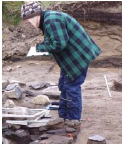
FIGURE 8: Drawing of the structures