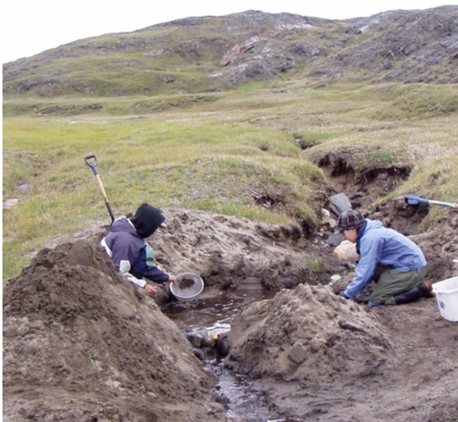
FIGURE 15: Water sieving

Field method use was identical to the previous fieldworks on the site (c.f. Avataq Cultural Institute 2003 and 2004). All sediments from the archaeological layers was water sieved (Figure 15). As usual we also had a field laboratory where artifacts were first treated and packed and water sieving residues were sorted (Figure 16). The fragility of certain bones required the use of pH Neutral PVA Adhesive to extract them properly (Figure 17).