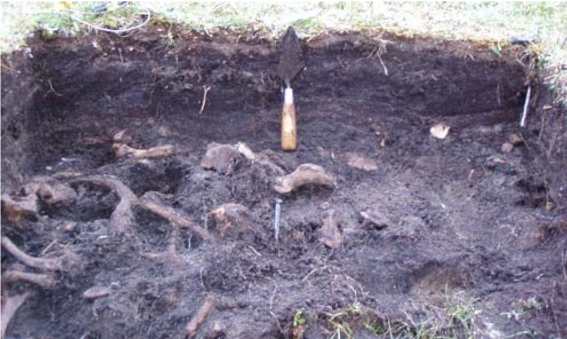
FIGURE 11: Wall profile of the test pit, view toward north.

We also excavated during weekends a test pit near Taylor's trench number 6. The excavation yielded a large quantity of bone and also many lithic artifacts showing the good remaining potential in the north area of the site however the stratigraphy is more difficult to understand (Figure 11). Our work permitted us to identify two layers that are maybe representing a single layer. We had no time to go deeper to identify other levels but compared with Taylor's work this is to be expected (Figures 12 and 13).