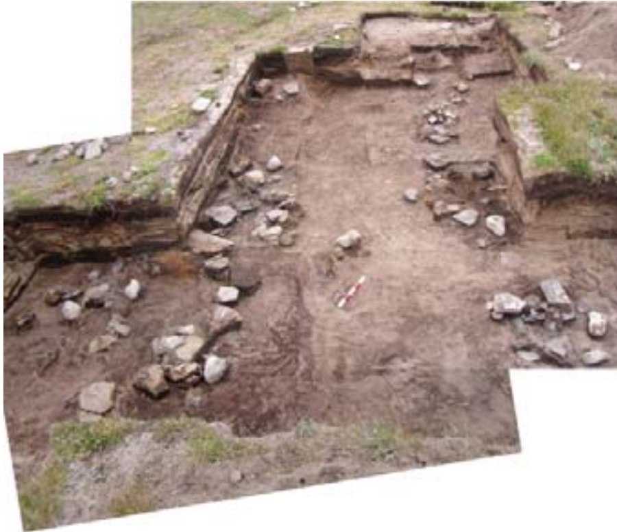
FIGURE 7: Structures of Tayara level II, view toward the south.