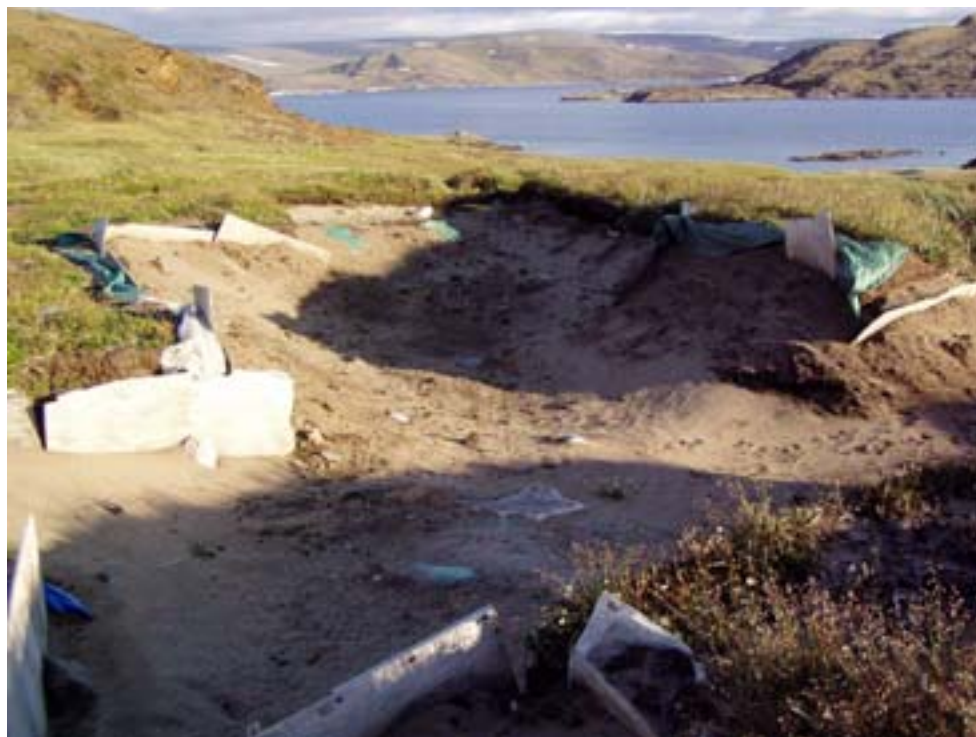
FIGURE 3: Site as it was when we arrived in mid-July 2005, view toward southwest

The site was excavated during a short period because we had a limited budget. We left Montreal on July 14 th and for different reasons (fog, strong wind...) we were not able to go on the island until July 17 th and finally rain prevented us from working with the excavation team on the Tayara site (KbFk-7) until July 19 th . The site had been covered with plastic tarps and the holes were filled at the end of the fieldwork season in 2003. Two years later everything had stayed in good condition, especially the wall profile protected with plywood (Figure 3).