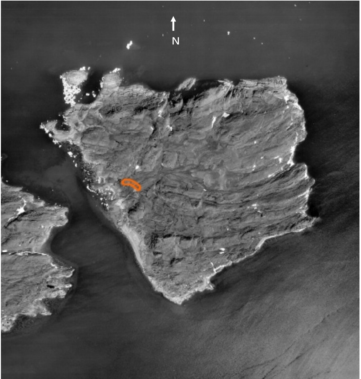
FIGURE 1: Qikirtaq, localization of the KbFk-7 site (1:20000)