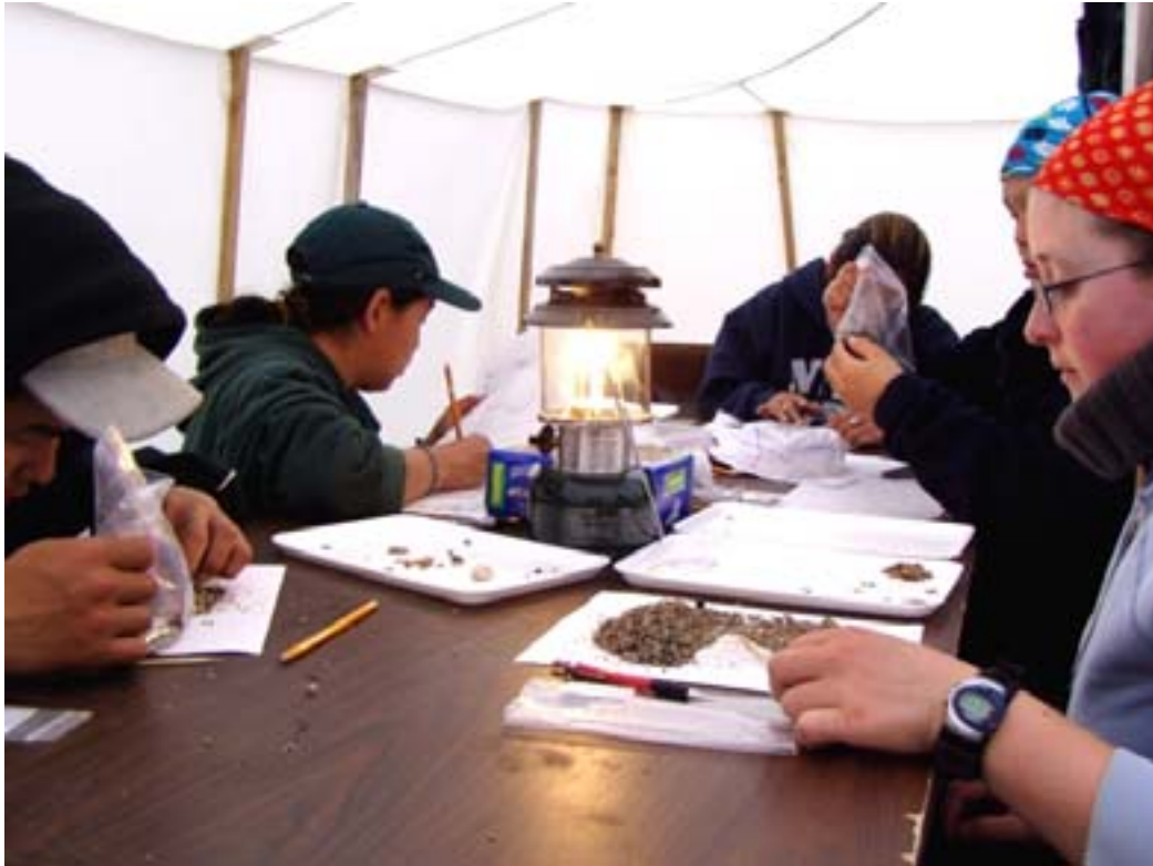
FIGURE 16: Field laboratory