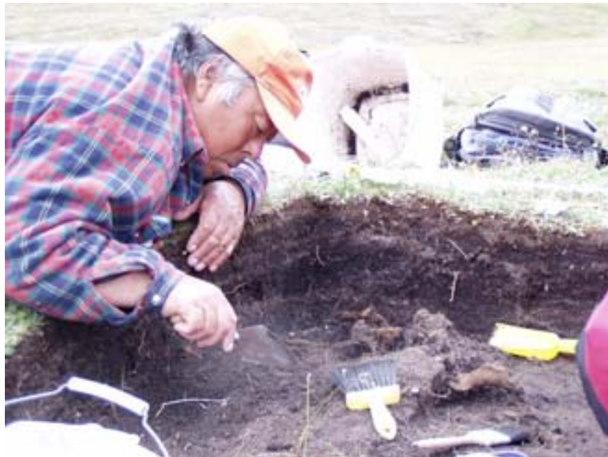
FIGURE 13: Mosusie helping us during weekend excavation