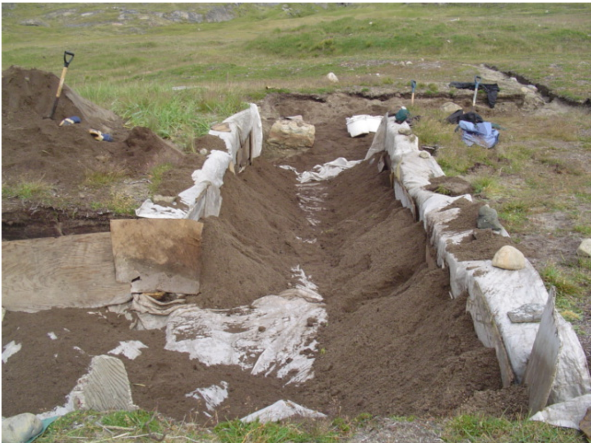
FIGURE 14: Closing the site, view toward north

The site was closed with plastic tarps covered almost completely by sand, filling the hole of the excavation (Figure 14). Finally we left the site around the 10 th of August without having time to visit the Toonoo site as it was initially planned when we applied for the archaeological permit.