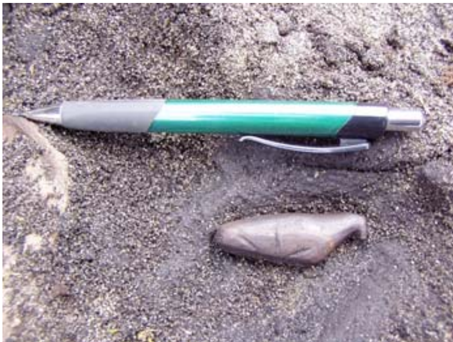
FIGURE 6: Walrus carving in situ