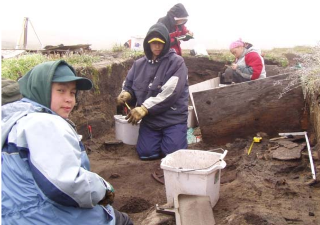
FIGURE 4: Excavation of level II

Until the beginning of August we worked to finish the excavation of what remained of the level II from the 2003 excavation (figure 4). As we were expecting we discovered in situ many new artifacts, bones and charcoal samples in a good state of preservation (Figure 5). Among others, we also discover a nice walrus carving (Figure 6). After that we were able to do a general cleanup of all zones excavated during previous years. This permitted us to have a general view of the structure and to take numerous pictures to complement the map of the structures (Figure 7, Figure 8 and Figure 9). With the rest of the pictures, a little more than a dozen pictures were taken to document the excavation directly classified in the computer each evening.