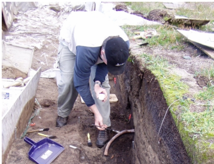
FIGURE 17: Treating fragile bones