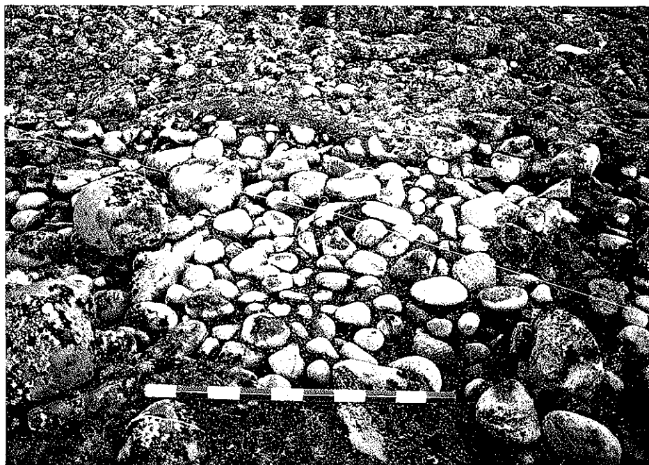
Photo 14. Structure 18 partially excavated (CY-CZ 84-85). Toward the northwest.