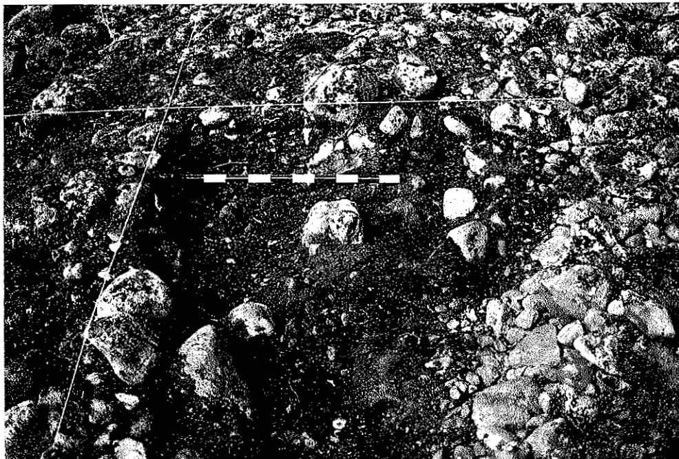
Photo 3. Partially excavated southeast quadrant of Structure 8, toward the north.