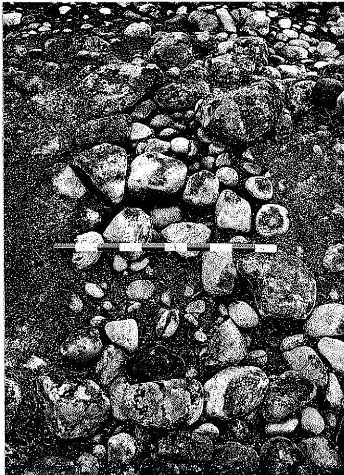
Photo 15. Structure 19 partially excavated (DG 78-79). Toward the south.