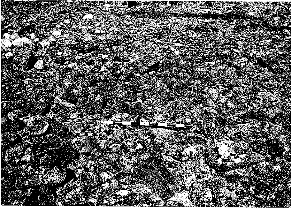
Photo 9. Structure 15 prior to excavation, toward the northeast.