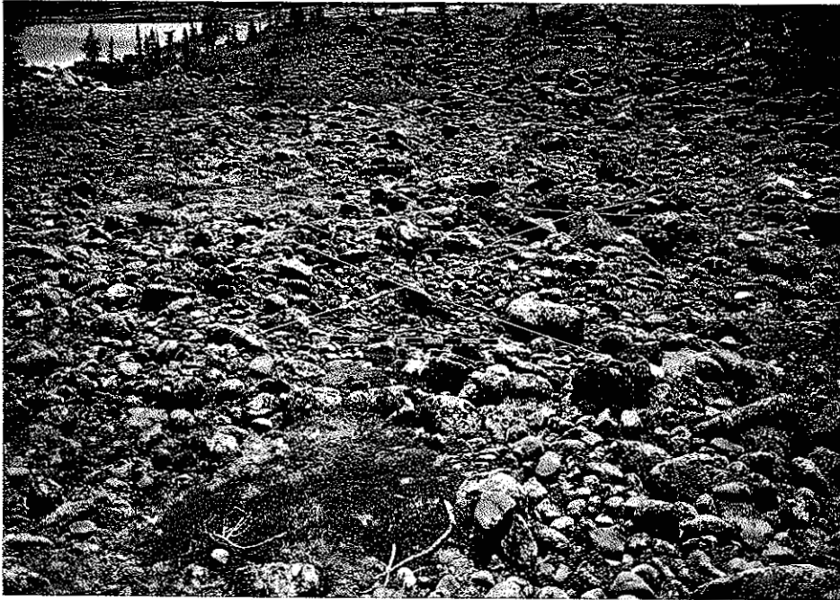
Photo 7. Structure 10 prior to excavation, toward the southwest.