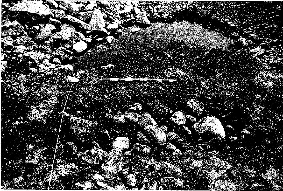
Photo 11. Structure 16, BY-BZ 56, toward the south. Note the extraction zone in the background