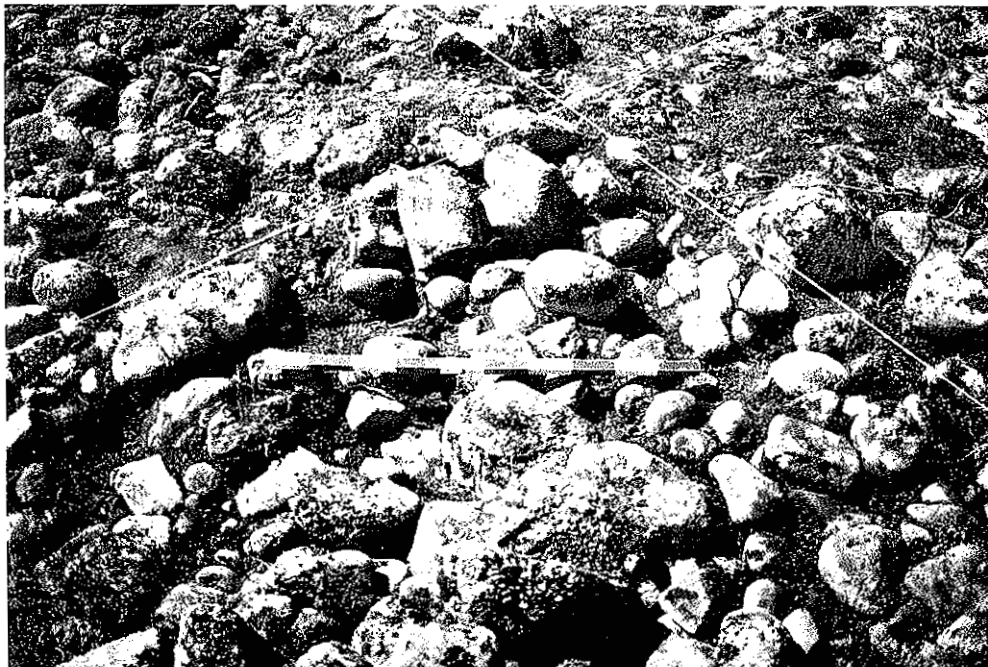
Photo 2. Southeast quadrant of Structure 8, toward the northwest.