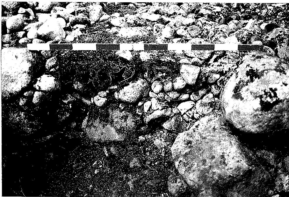
Photo 13. West stratigraphic profile of DD 87, immediately north of Structure 17.