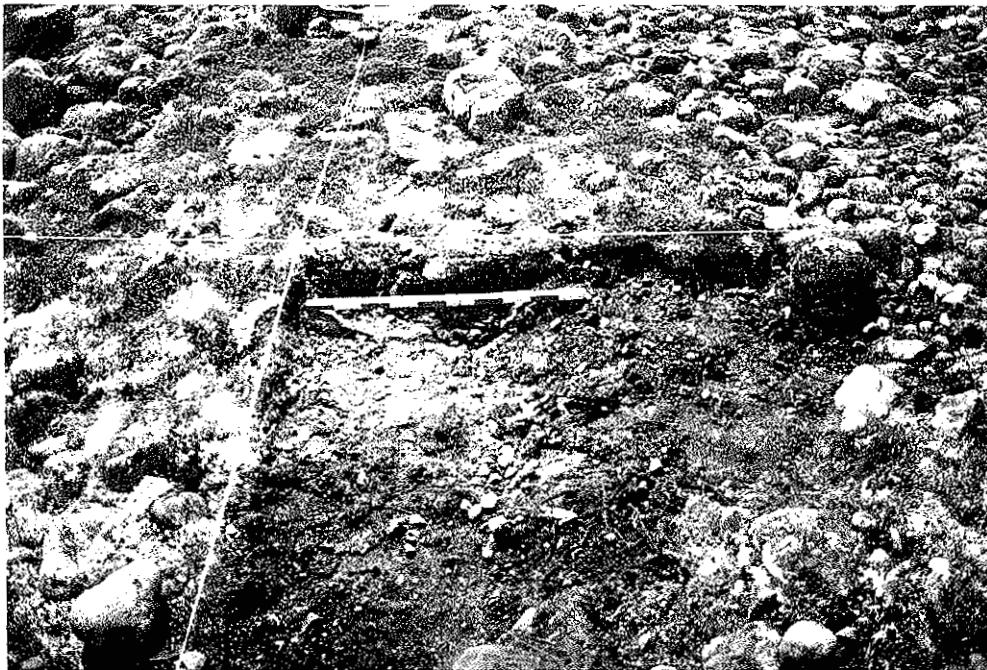
Photo 6. Partially excavated northeast quadrant of Structure 9, toward the west.