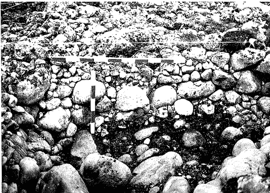
Photo 8. West stratigraphic profile of the northeast quadrant of Structure 10.