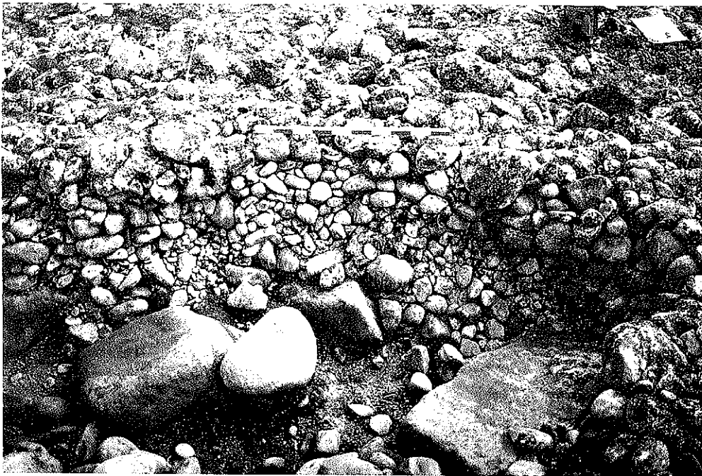
Photo 10. South stratigraphic profile of Structure 15.