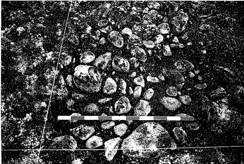
Photo 5. Northeast quadrant of Structure 9, toward the north.