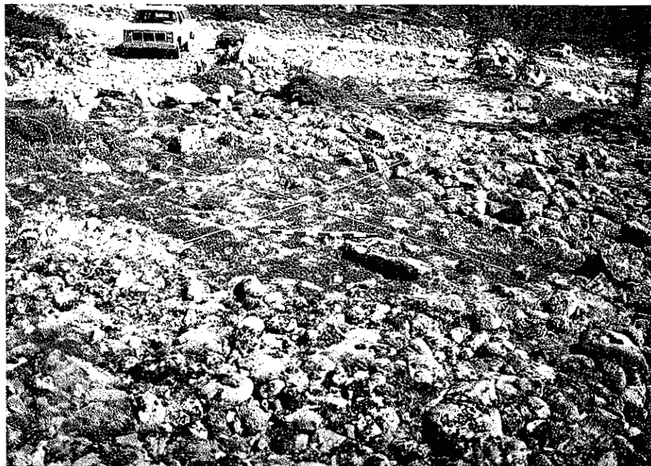
Photo 4. Structure 9 prior to excavation, toward the southeast.