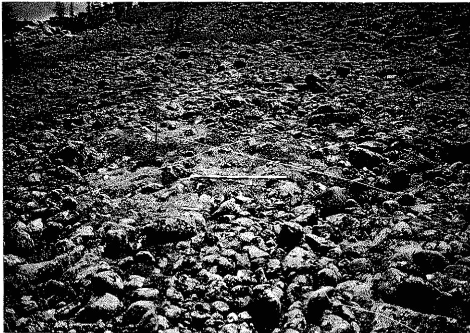
Photo 1. Structure 8 prior to excavation, toward the southwest.